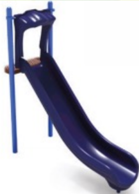
Single Velocity Slide