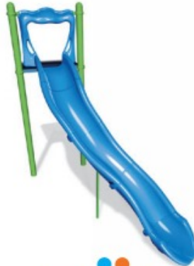
Single Cascade Slide