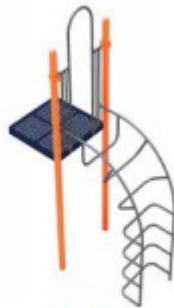
Loop Arch Climber

With handhold & return step Deck Height: 2' to 5'4"