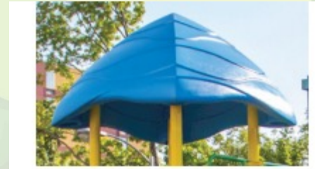
Curvy Canopy Roof