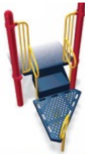
Triangle Transfer Point

With handhold & return step Deck Height: 2' to 5'4"