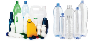
Plastic bottles and containers (#1 and #2 only). Remove and discard lids.