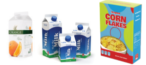
Milk cartons, juice cartons and aseptic containers